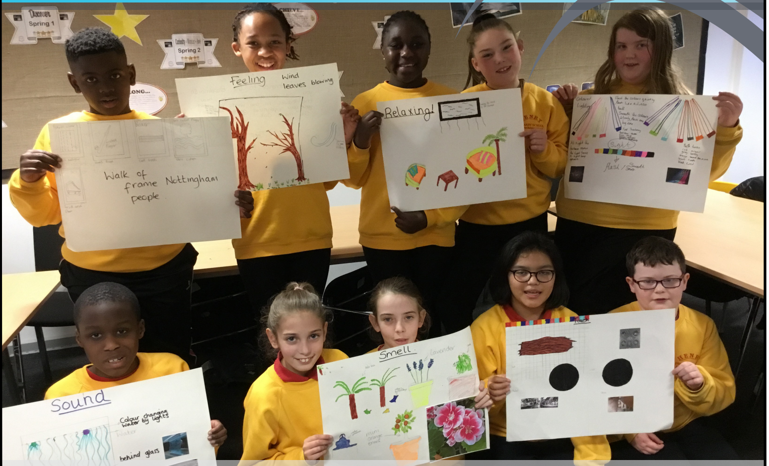
Henry Whipple pupils show off the visuals used during their presentation

The week commencing 16th November saw Primary parliament take place for the second time in a virtual environment. Classrooms and home-offices united on Microsoft teams to engage in workshops that saw pupils from various schools in Nottingham share their creative ideas for the redevelopment of Broadmarsh. The workshops were centred around the ideas of Broadmarsh being a green place, somewhere that children and families can be curious and creative, and a place that celebrates Nottingham's rebellious past.